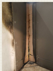
Fig. 2: after testing scenario 1