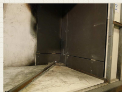
Fig. 1: before testing scenario 1