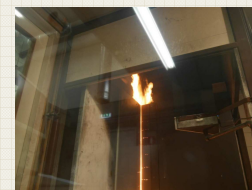
Fig. 5: during the test of scenario 2