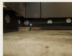
Fig. 4: before testing scenario 2

* Tests performed a year earlier with K15 insulation, but different thickness.